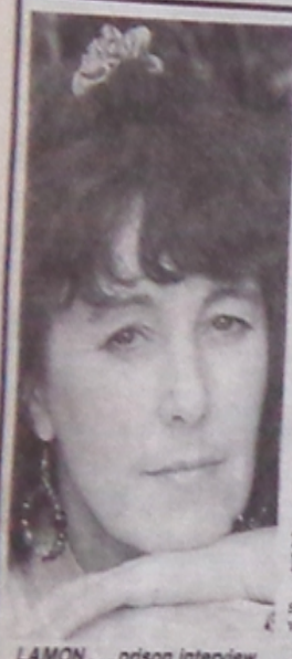
LAMON... prison interview